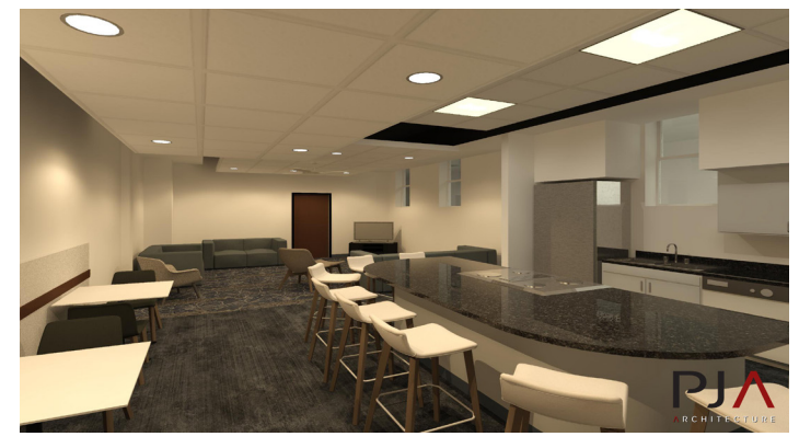
Good Shepherd Kitchen Proposed Renovation