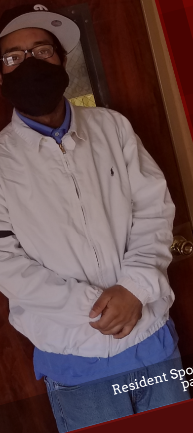
○ Resident Spotlight page 04