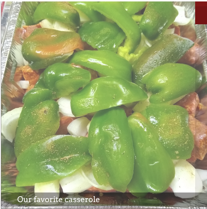
Our favorite casserole