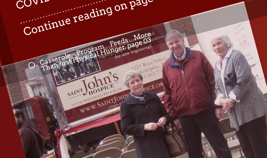
○ Casserole Program Feeds More Than Just Physical Hunger page 03